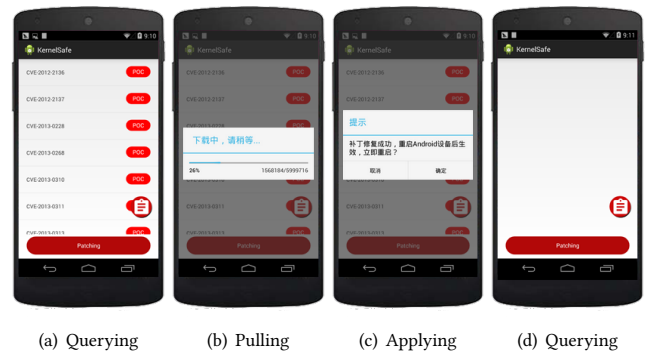
Figure 3: Vulnerabilities Patching for Nexus5

Take Nexus 5 as an example, it has 200 reported vulnerabilities ranging from the year 2012 to 2016. As maintainers of the devices, manufacturers should patch all of those vulnerabilities and especially patch the High severity ones immediately. Figure 3 shows binary patching process for Nexus5. If there is an update patch offered in manufacturer’s cloud, the detailed vulnerabilities queried by KernelSafe are shown in Figure 3(a). Then, KernelSafe pulls the binary patch, applies the patch to the kernel, and reboot the device as shown in Figure 3(b) and Figure 3(c). After rebooting, the vulnerabilities are eliminated. At this time, if the user query again, there is no available patches as shown in Figure 3(d).